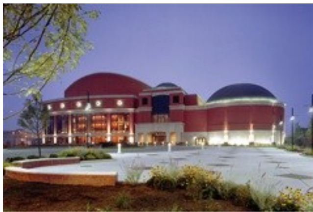
Clay Center for the Arts and Sciences of West Virginia