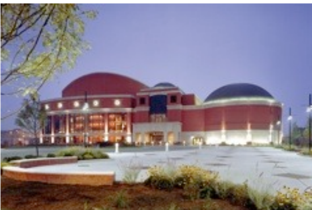
Clay Center for the Arts and Sciences of West Virginia

Another new event will be a Lunch Time Roundtable for the collegiate singers with our headliner and other directors. Teachers will be welcome to this as well. The idea behind this is to give the collegiate singers more of an opportunity to see what ACDA is about. They can ask questions about job searching, things to learn that college did not have in their curricula, and meet experienced teacher/directors that may become mentors for them. We are encouraging all of the collegiate singers to participate!